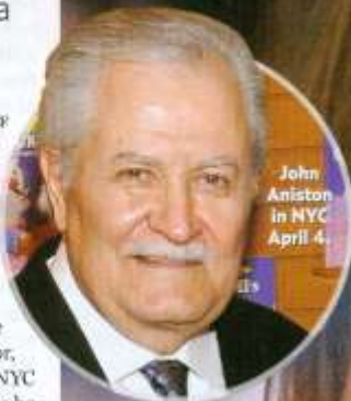
John Aniston in NYC April 4.

A LL PARENTS OF a certain age fantasize about having grandkids, and Jennifer Aniston's dad, John, is no exception. "Being a granddad is the perfect situation," the Days of Our Lives actor, 75, told Us April 4 at an NYC Barnes & Noble, where he read from Loukoumi's Good Deeds , a kids' book and audio CD he co-narrated with his daughter. "You get the grandkids, play with them, have a good time. Then, at the end of the day, you say,