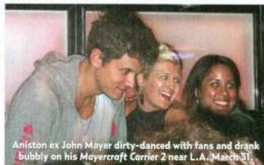
Aniston ex John Mayer dirty-danced with fans and drank bubbly on his Mayercraft Carrier 2 near L.A. (March 31).