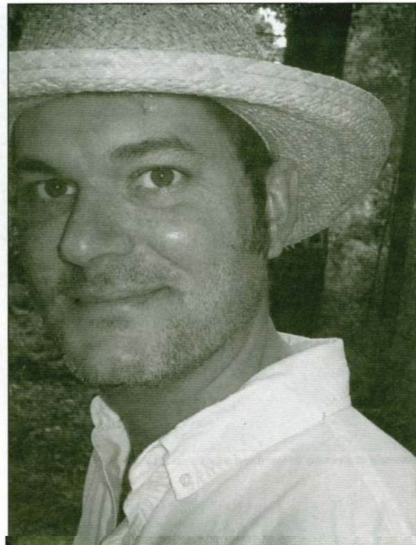
Author and illustrator Mo Willems

For Willem, who has a young daughter, both Knuffle Bunny books are semi-autobiographical. The word "knuffle" is even a relic of the author's childhood, a mis-